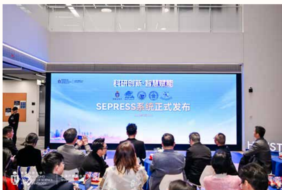
The SEPRESS system launch ceremony.